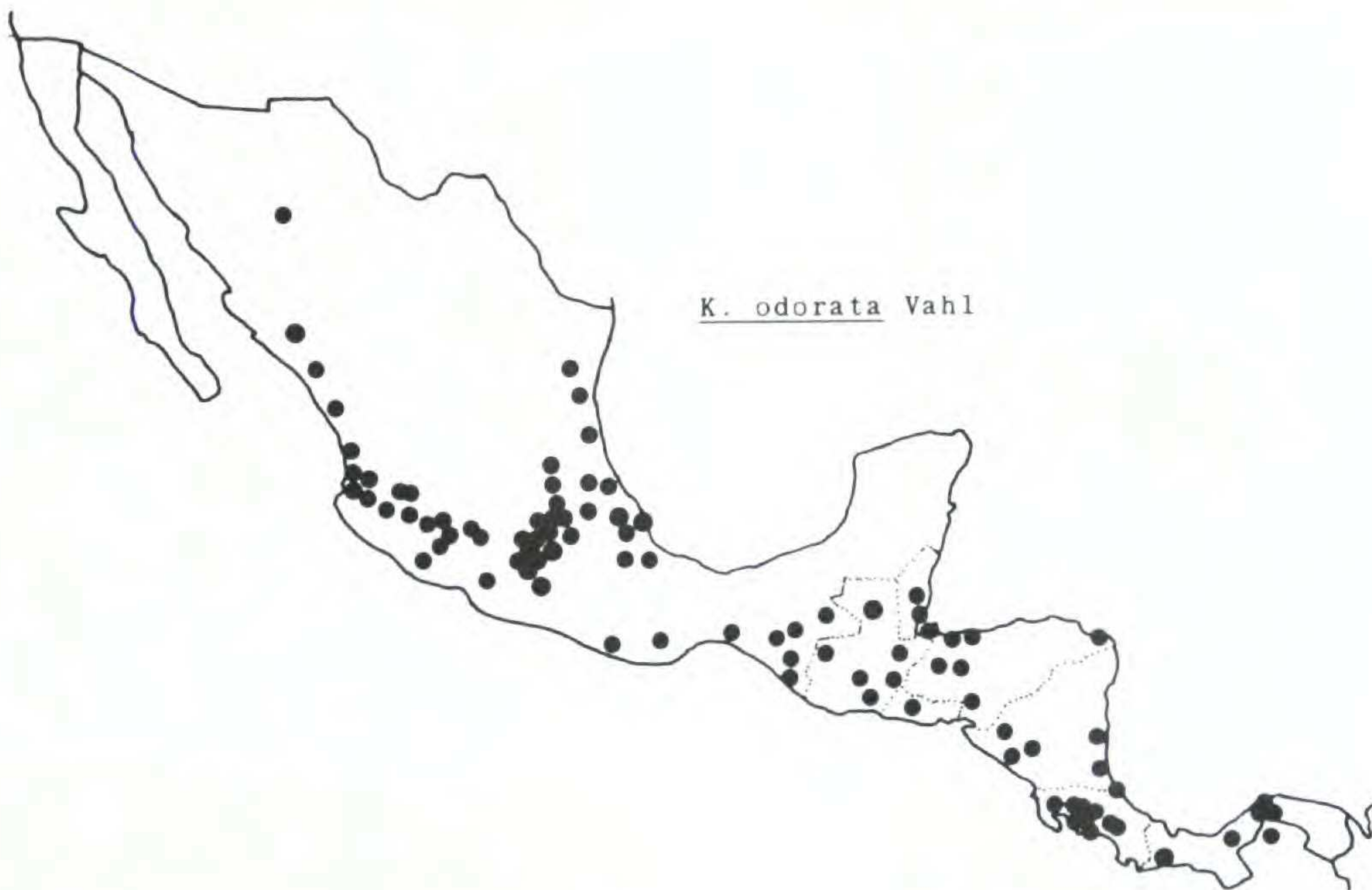
Figure 2. Distribution of K. odorata in Mexico and Central America.

Spikelets (50) 75–150, ovate to ovate-lanceolate, whitish, (1.8) 2.3–2.8 (3.6) mm long, 1–1.3 mm wide. Scales broadly ovate, 2–2.5 mm long, (1.2) 1.8–2.6 mm wide, whitish, often red-speckled, mucronate, the apex often excurved, (5) 7 (9) nerved, the keel smooth or with 1–6 spinulose prickles in the distal half, whitish to greenish. Stamens 2; anthers (0.4) 0.6–0.8 (1.0) mm long, linear; filaments 2–2.4 mm long. Styles 0.6–1 mm long; stigmatic branches 2, 0.3–0.6 mm long. Achenes lenticular, oblong-ovate, 1.2–1.5 mm long, 0.7–0.8 (0.9) mm wide, apex broadly rounded to subtruncate, apiculate, the stipitate base 0.1–0.2 mm long, about 0.2 mm wide, surface papillose, reddish brown to dark brown, strongly contrasting with the whitish base and apiculus.